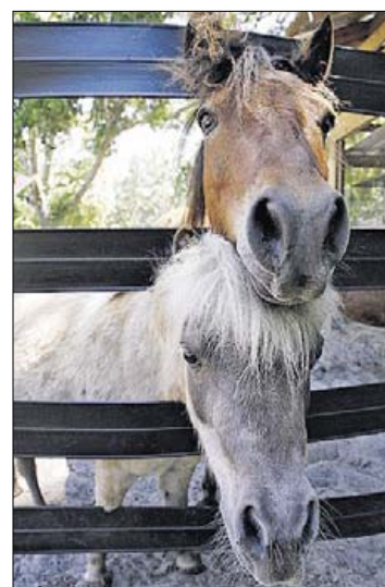
Rockin' Horse Farm in New Port Richey is home to a variety of animals, including horses of all sizes.

Devin was admitted to All Children's See DEVIN, 6